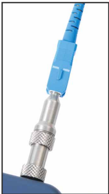
SC (APC Optional)

Applicable for UPC: SC/ FC/ ST/ LC/ SC Female/ LC Female(Included) Applicable for APC: SC/SC Female(Optional)