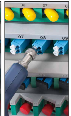
LC Female (APC Optional)