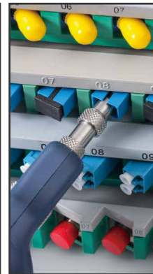
SC Female (APC Optional)